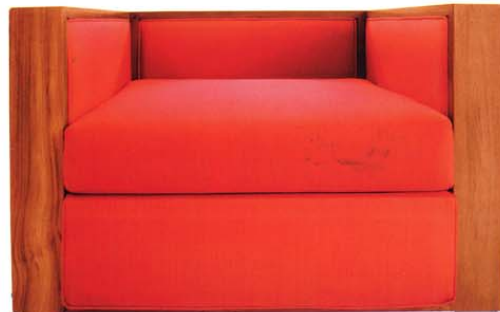
Vivid single seater sofa