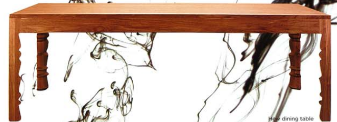
Hew dining table

After a decade in the interior design industry, working her way up from draughtsman to creative director, the Malaysian Institute of Art graduate is well equipped to take on this new challenge. She finally took the plunge in early 2011, after many years of talking and dreaming about striking out on her own.