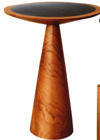
Fossil round table