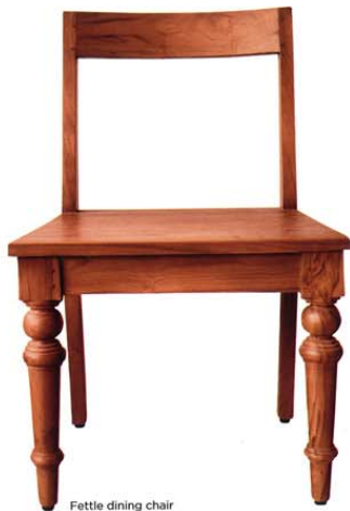
Fettle dining chair

"As a professional scouting for furniture for clients or myself, I always find it difficult locating furniture that is both of outstanding quality and truly Malaysia, designed and produced locally. Whatever is available is pretty standard and monotonous as it's mainly mass-produced. That's where Kerusi comes in to fill the gap as we create pieces with greater individuality and character," she enthuses.